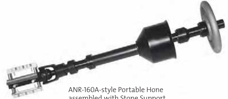
ANR-160A-style Portable Hone assembled with Stone Support, Single Length Master Holder Set, Stone Set and Drive Shank.

*FOR DIAMETER SIZES BELOW 2.5 INCHES (64MM), CONTACT YOUR SUNNEN FIELD ENGINEER.