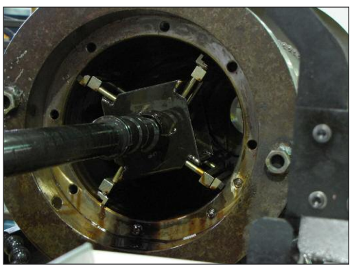
The Sunnen HTA tube honing system handles parts weighing up to 8000 lbs (3629 kg) with ID ranges from 2.5 inches to 21 inches (63.5 to 533 mm), and is available for 6-foot (2m) and 12-foot (4m) part lengths.

On the business side of the equation, the HTA hone has delivered excellent return on the investment. Goldstein cited an example of a large-bore, thin-walled steel cylinder that the company had outsourced due to the complexity of the honing operation required to get the part to spec. "This part is extremely hard to hone," said Goldstein. "The manufacturer would have to make three or four parts to get one to spec, and that makes for a very expensive part." Air Hydro developed special fixturing for the part and was able to hone it inhouse with the HTA. "It took us some time to get the set up right," said Goldstein. "But, in the big picture we saved a lot of money."