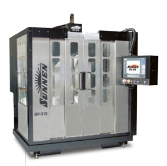
SV-310 VERTICAL HONING MACHINE

This versatile system combines power, precision, durability, and technology to make vertical honing more economical and productive than ever before.