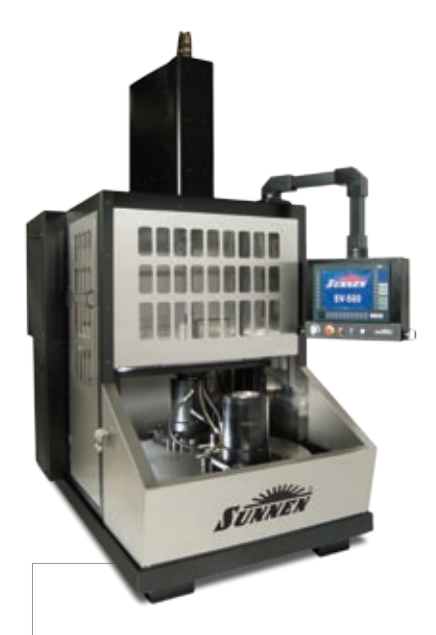
SV-500 VERTICAL HONING MACHINE

The SV-500 features the latest in honing technology. Using a linear feed system that allows the most precise and fastest feed control on the market, this system delivers mid- to high-volume manufacturers the lowest costs per honed part.