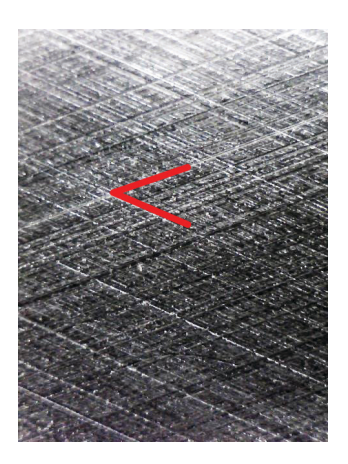
The new Sunnen2 controls on the SV-35 allow for a consistent crosshatch surface finish from the top to the bottom of the bore.